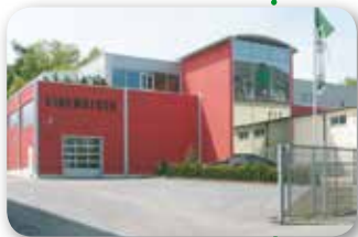
high-bay warehouse & administration