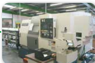
steel part production