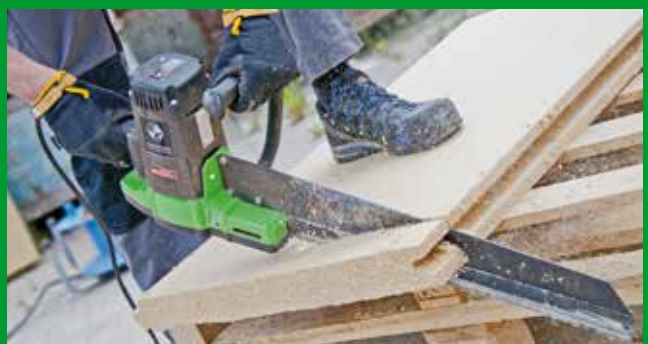
pressure-resistant insulation material