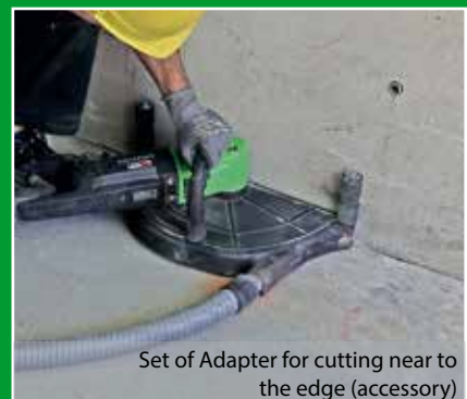
Set of Adapter for cutting near to the edge (accessory)