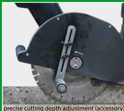
precise cutting depth adjustment (accessory)